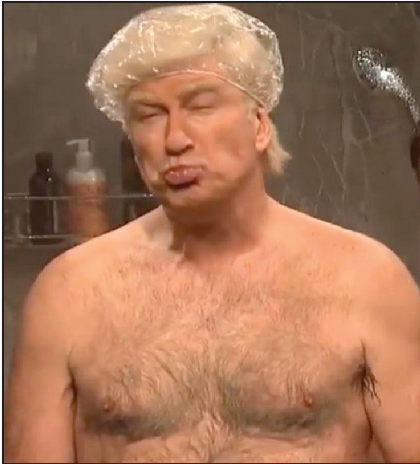
Donald "Pussy Grabber" Trump

I propose a cage match between Trump and Gharibi. If Trump wins, US troops can stay in the Middle East. If Gharibi wins, all US troops have to leave. No innocents get harmed. Sounds fair to me. - Hogege Bill